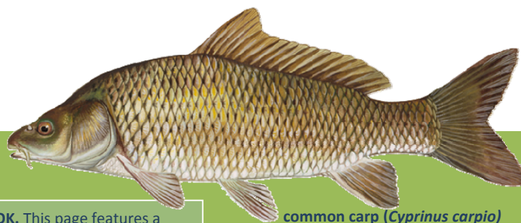
common carp ( Cyprinus carpio )